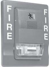
Genesis Chime-strobe with optional trim plate

Genesis chimes and strobes mount to any standard one-gang surface or flush electrical box. Matching optional trim plates are used to cover oversized openings and can accommodate one-gang, two-gang, four-inch square, or octagonal boxes, and European 100 mm square.